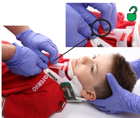
Figure 5: Adjustment mandible support