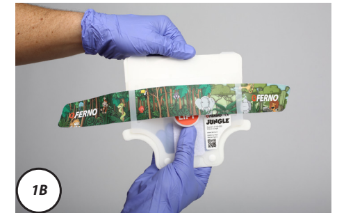
Figure 1- A: Occipital Support (rear) B: Lift to adjust

The collar is in its STANDARD position when packaged, ideal for most pediatric patients. (Fig. 2). The locking tab on the rear is open (not locked, Fig. 3).