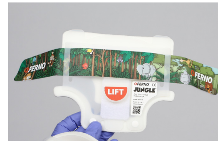
Figure 2: Occipital Support in STANDARD position

The collar is in its STANDARD position when packaged, ideal for most pediatric patients. (Fig. 2). The locking tab on the rear is open (not locked, Fig. 3).