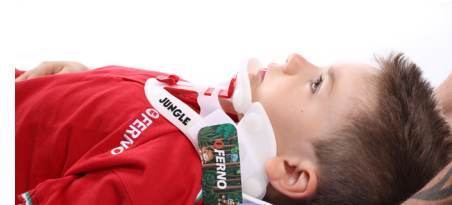
Figure 6: Cervical collar correctly applied (red mandible support cam locked)

The collar is now properly applied to the pediatric patient ( Figure 6 ). Proceed with pediatric patient immobilization as needed, following local protocols.