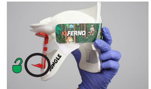
Figure 3: Mandible Support with locking tab in the OPEN position

Should the operator be undecided as the correct position, leave the occipital support in the STANDARD position (Fig. 2). Be aware that efficiency may be reduced.